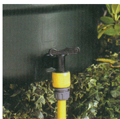
Water Butt Tap with hose connector shown on a garden water storage barrel

The Water Butt Tap is also compatible with a wide range of chemicals and food products and has the added benefit of being made from black plastic for outdoor use, to better withstand the sun. The NW50 cap fits on IBCs (1000L tanks) that have an NW50 thread on the outlet, or we can supply an adaptor to convert your IBC fitting to NW50. The tap on its own is a useful addition to rainwater storage barrels in the home garden.