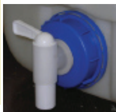
700630 Aeroflow tap

700633 White Smoothflow Tap with blue 70mm cap $4.60ea