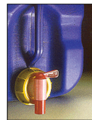
Aeroflow tap shown here fitted to a cap on an industrial container