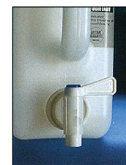
SmoothFlow tap shown fitted to 38mm cap on a water container