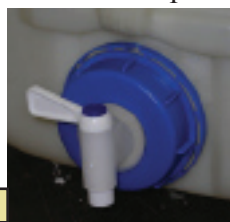
700633 Smoothflow tap